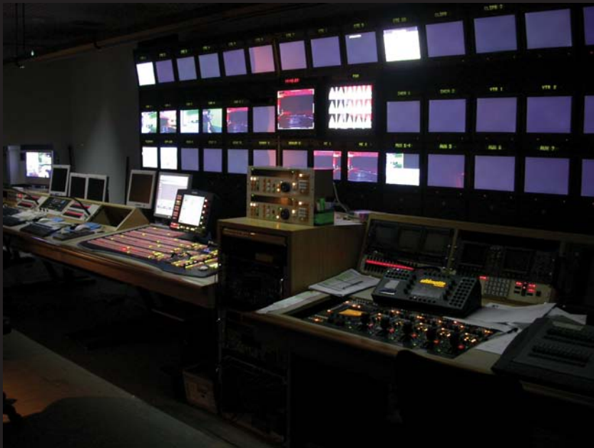
Private Broadcast Television