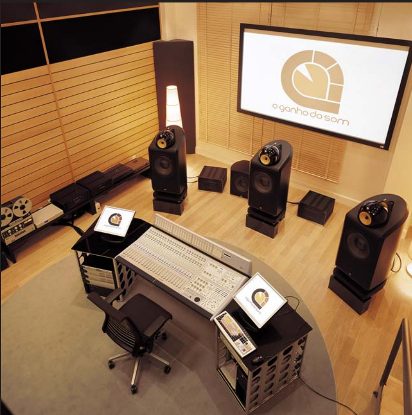
Mastering Studio O Ganho do Som