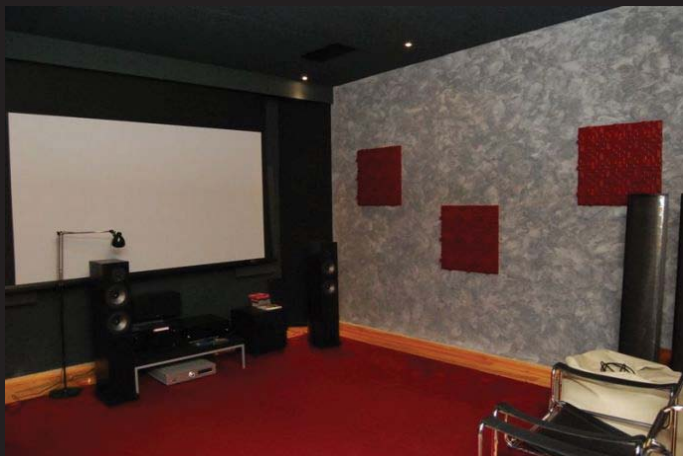
High-End Audio Stores