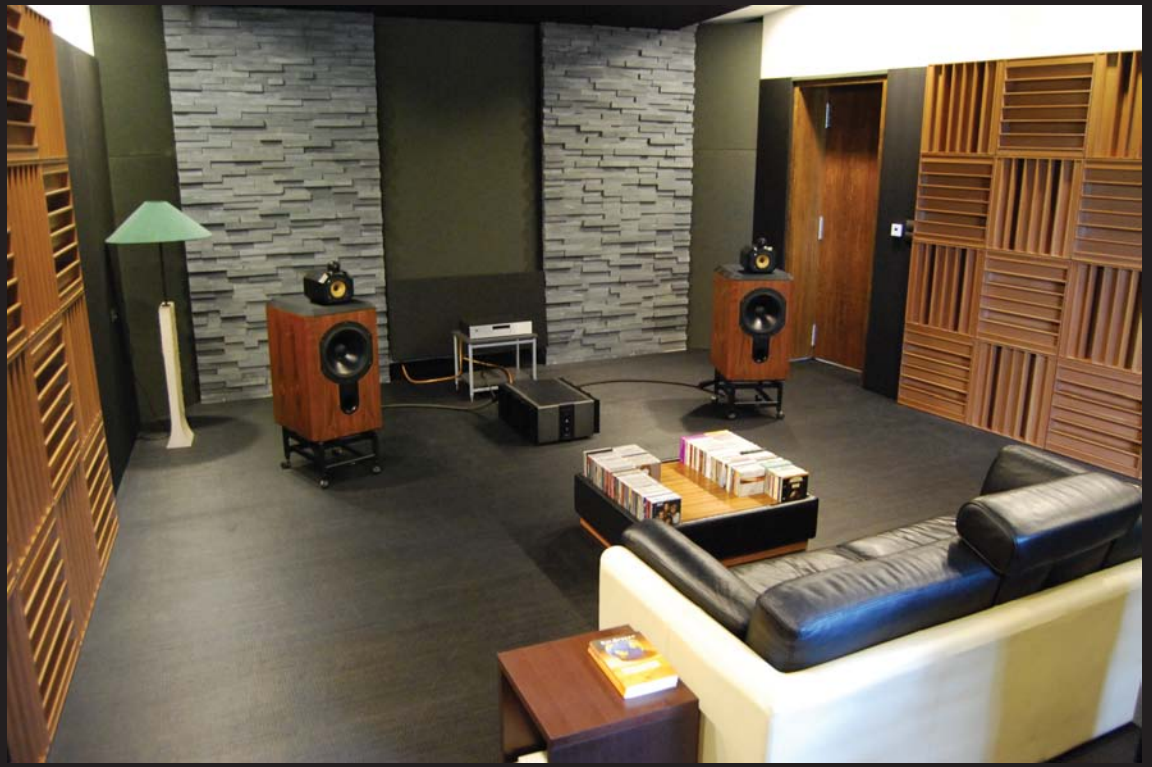
Private Home Music Rooms